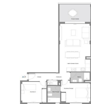
Vivienda 084 - Bloque B4 - Portal P7 - Planta P01 - Puerta A.