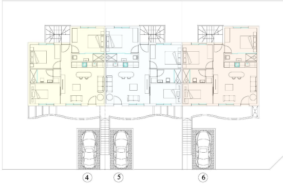
PENTHOUSE - PLANTA ALTA