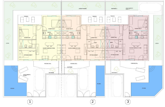
GROUND FLOOR - PLANTA BAJA