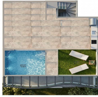
PENTHOUSE - PLANTA ALTA NO.5