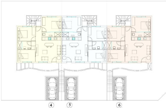
PENTHOUSE - PLANTA ALTA